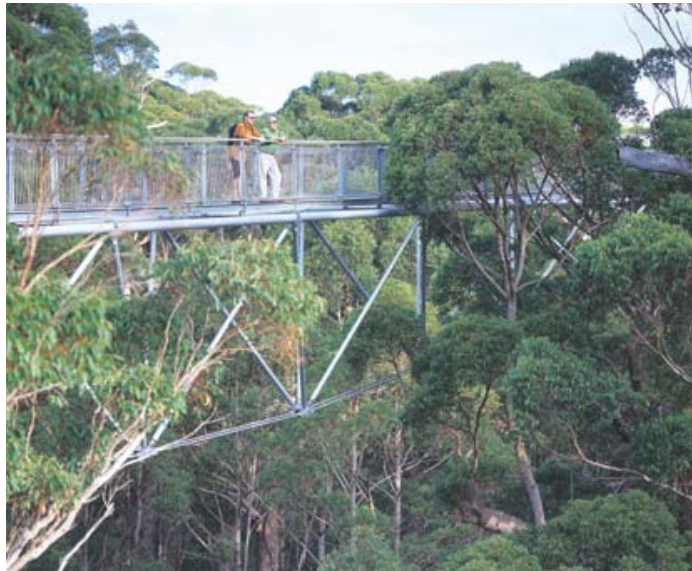
Award winning Tree-Top Walk