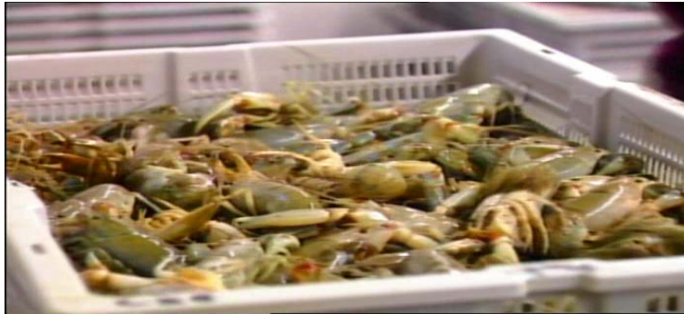
Yabbies being sorted for export