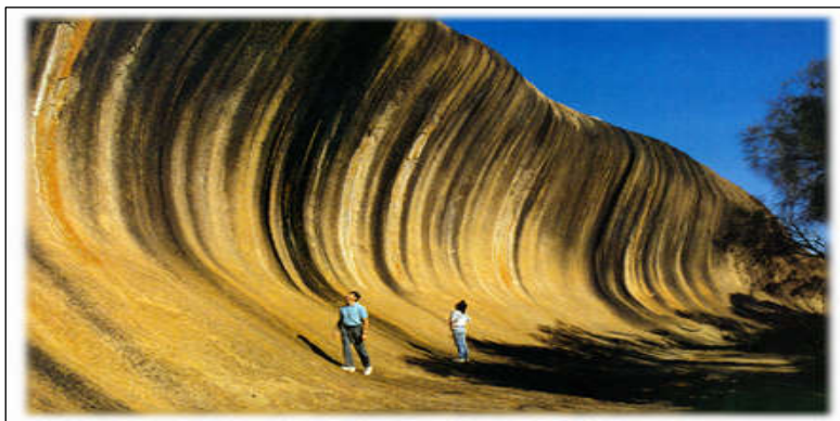
Wave Rock – a world famous tourism icon