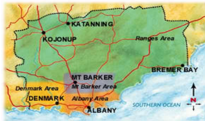
Albany – the centre of the Great Southern Region