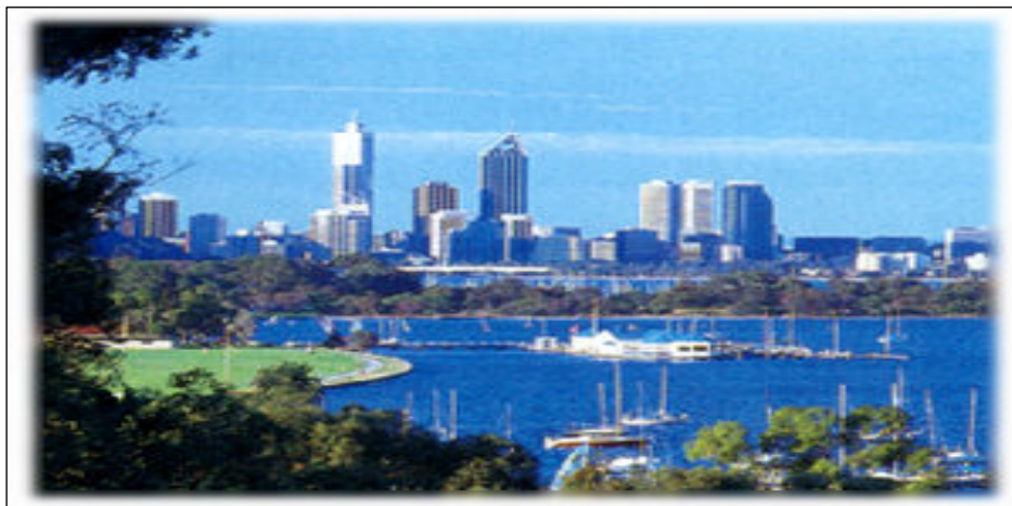
Perth – capital city for Western Australia